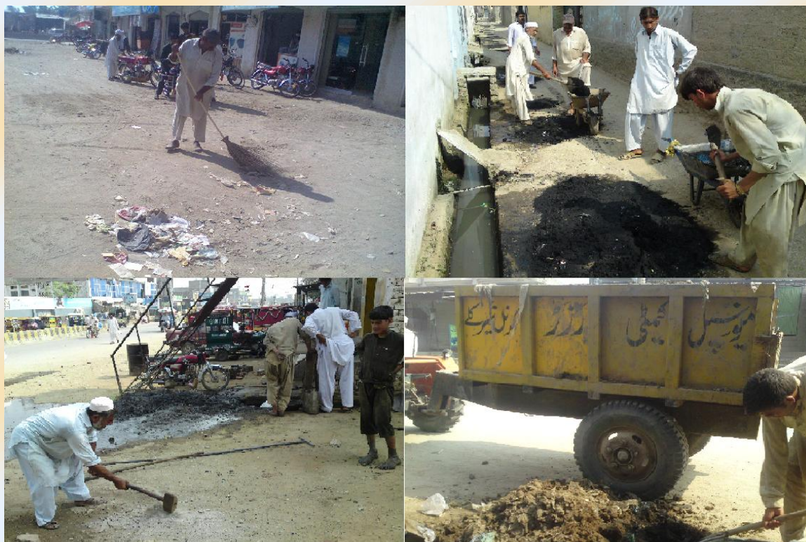
District Swabi in action