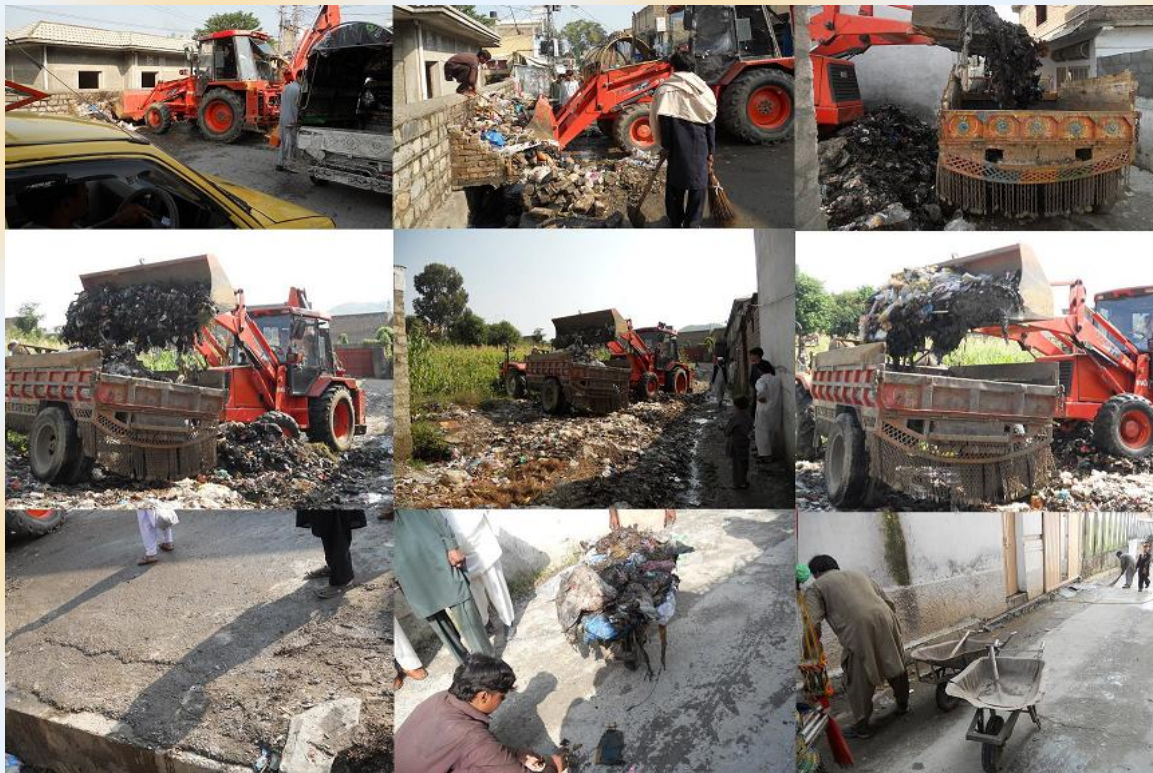
MC Mansehra in action