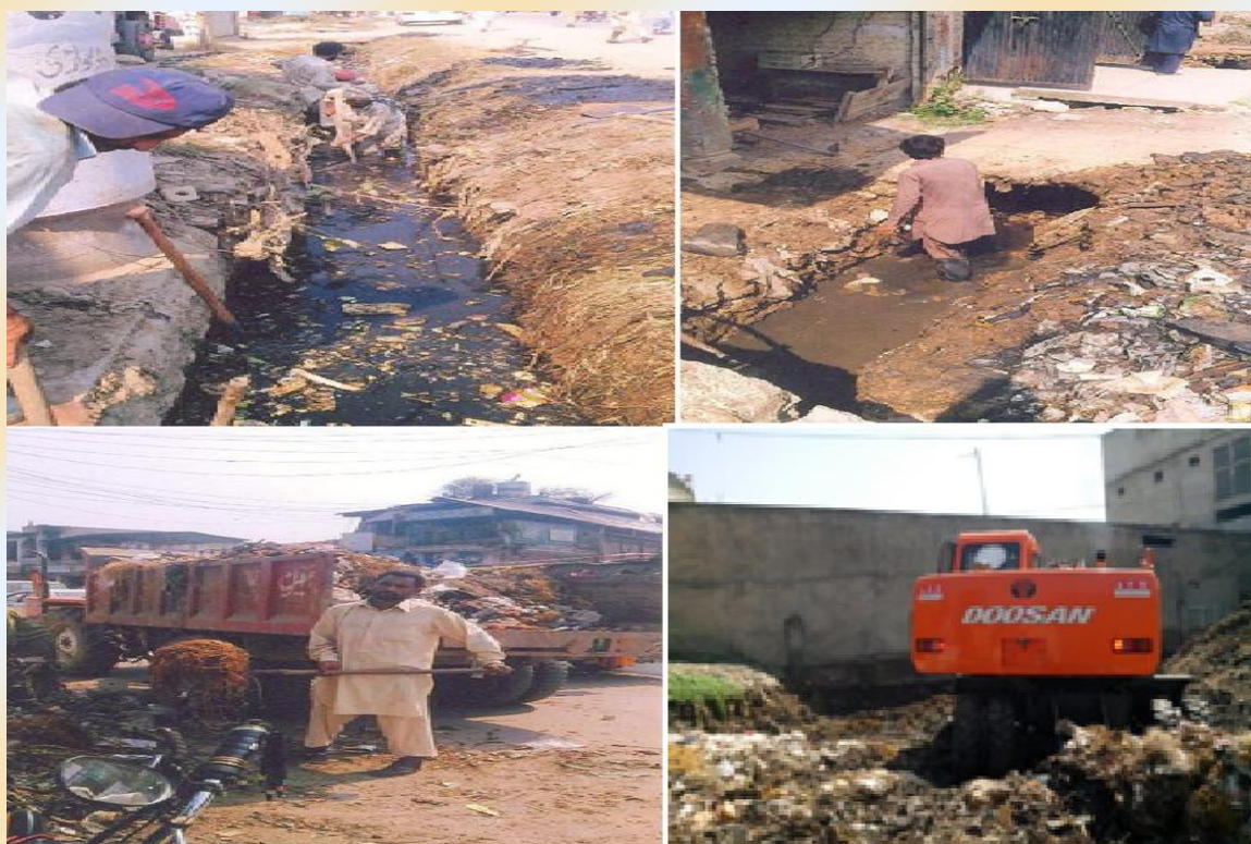
District Buner in action