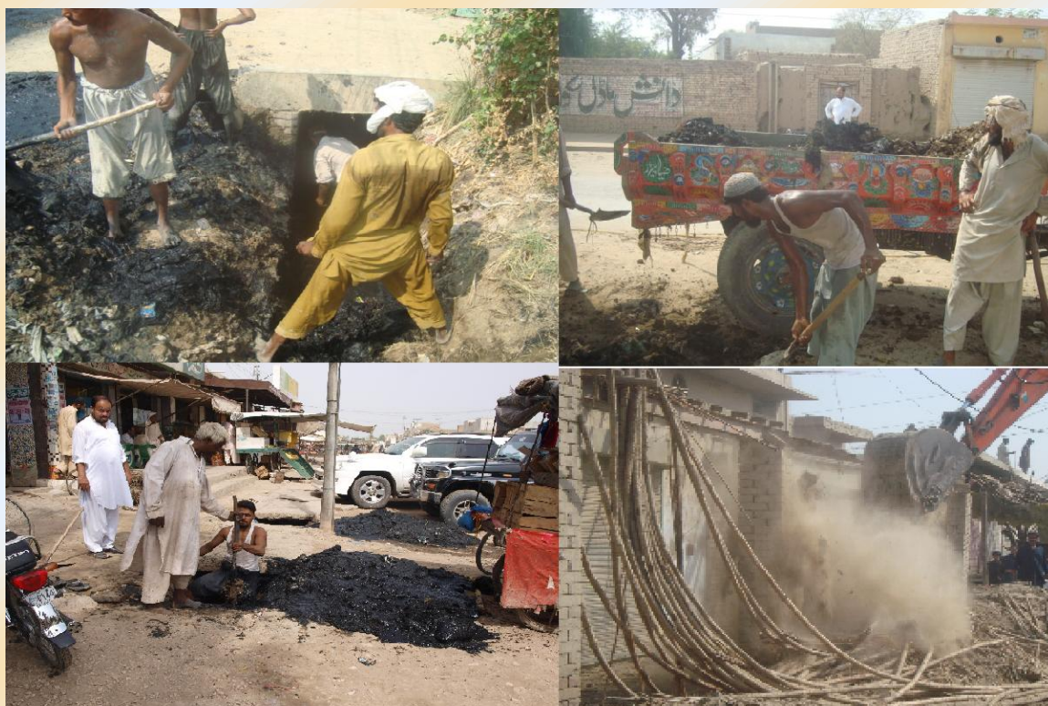
MC Dera Ismail Khan in action