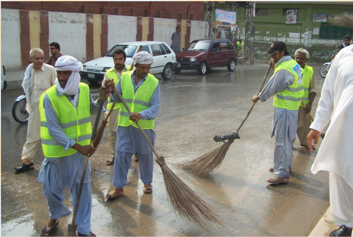
Washing of Roads

The Municipal Corporation Administration/staff performed to their best during the campaign to keep the area within the MC, Peshawar clean and provide the best municipality services to the dwellers of the area.