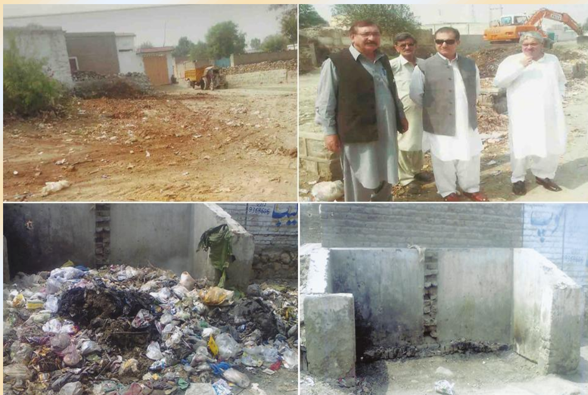
Nowshera at Campaign