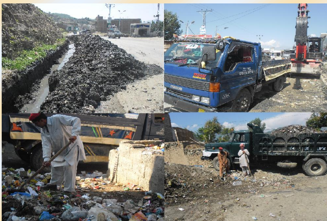
MC Dir (Lower) in action