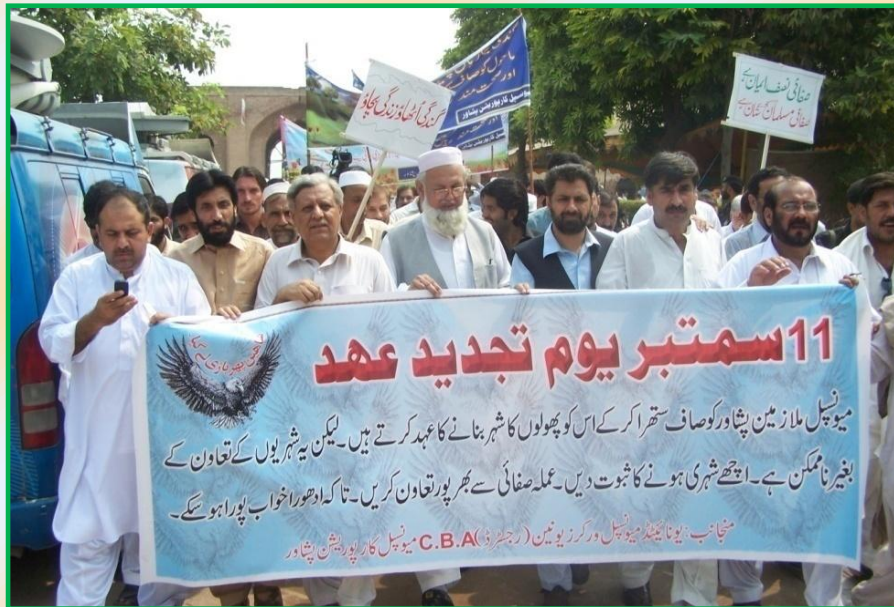
Walk for Life

In pursuance of the directives of the Provincial Government; the Local Government Department, Local Council Board and Local Councils have jointly started hectic efforts for provision of basic/mandatory municipal services to general public on priority basis and launched a one month sanitation campaign with effect from 11 th September 2013 but later on extended to 31 st December 2013.