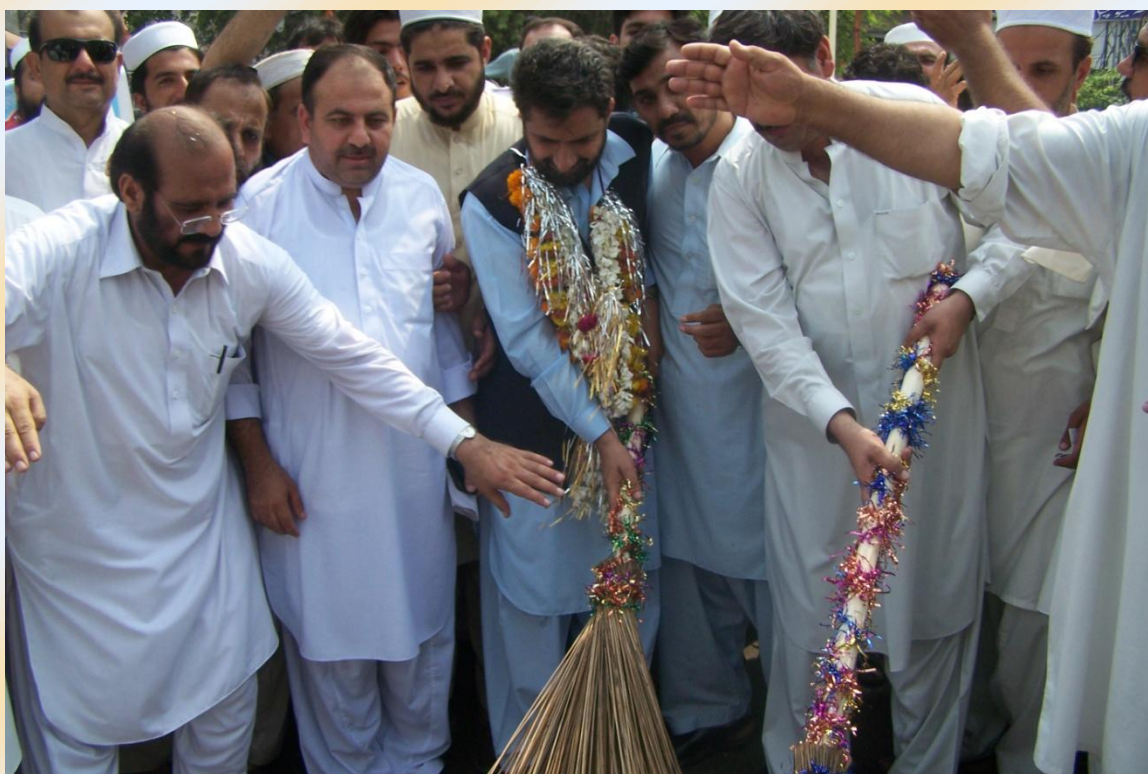
Leading by Example (Inauguration by Minister LGE&RDD)