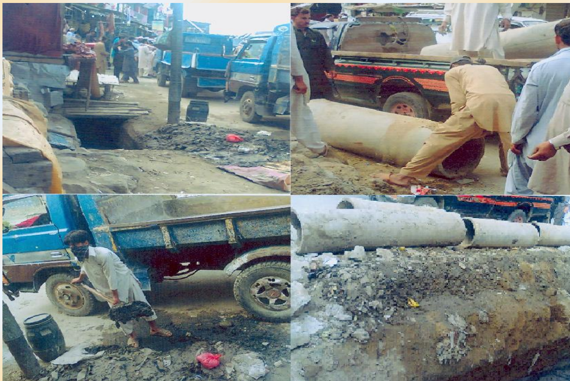
MC Dir (Upper) in action