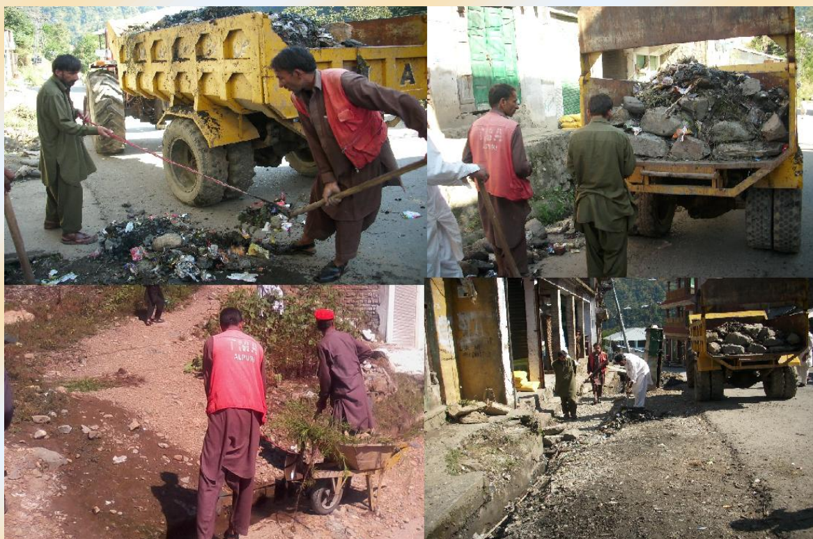
MC Shangla in action