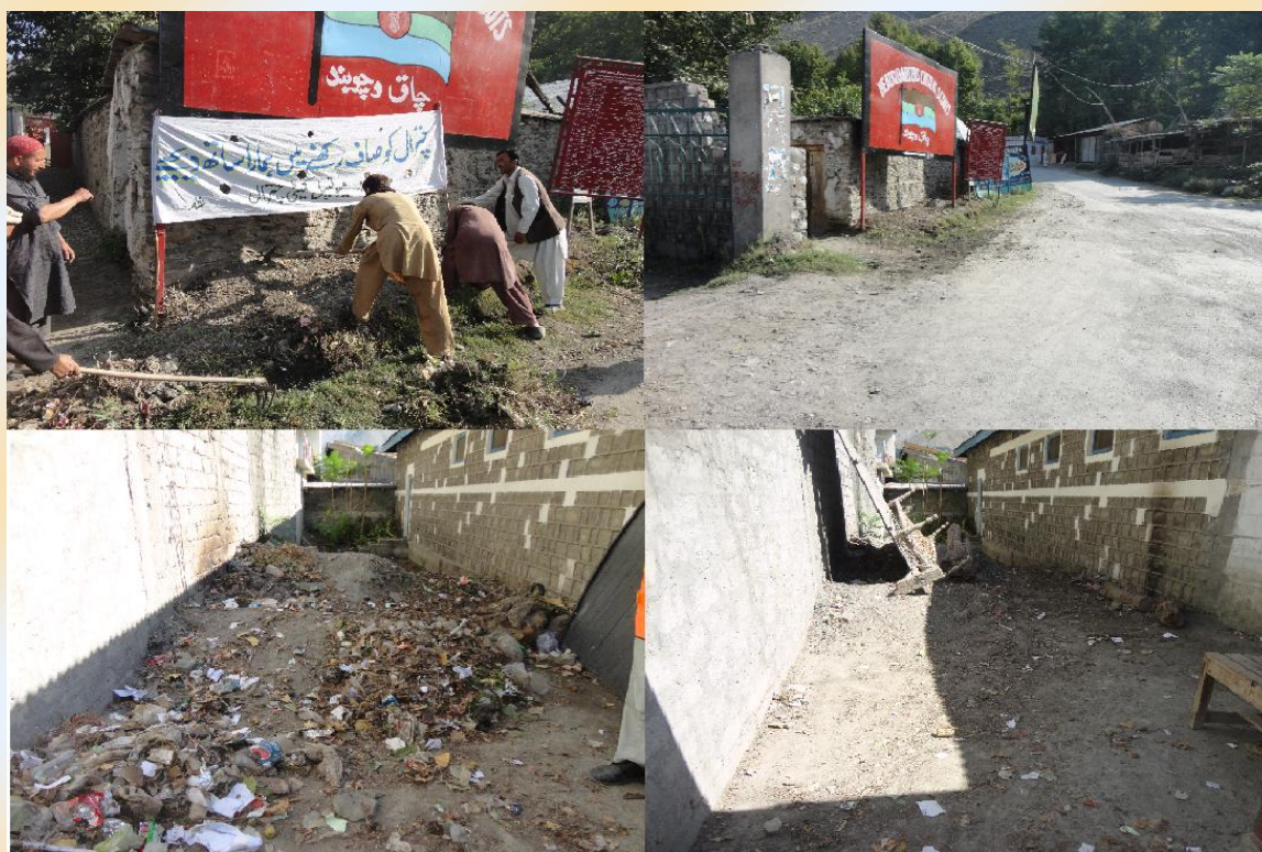
MC Chitral in action