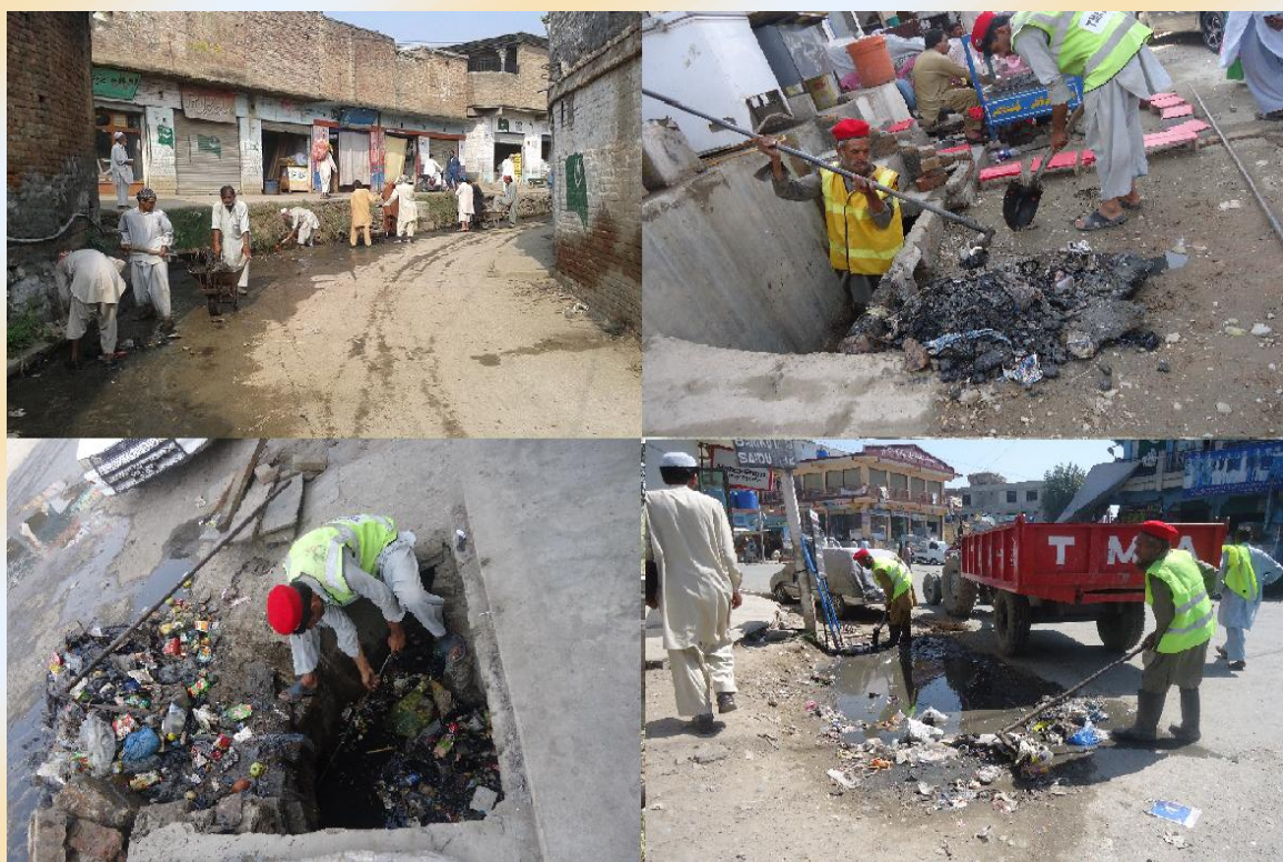
MC Swat in action