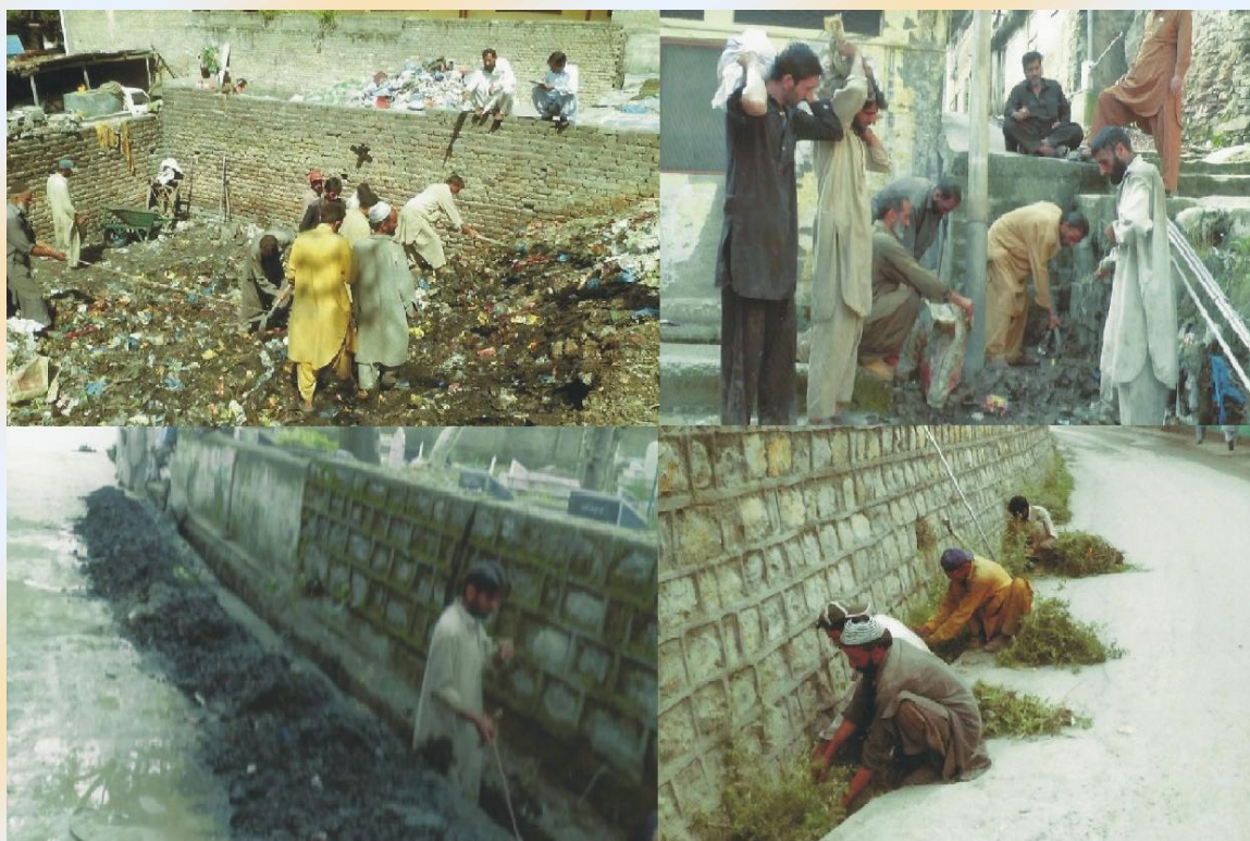
MC Abbotabad in action